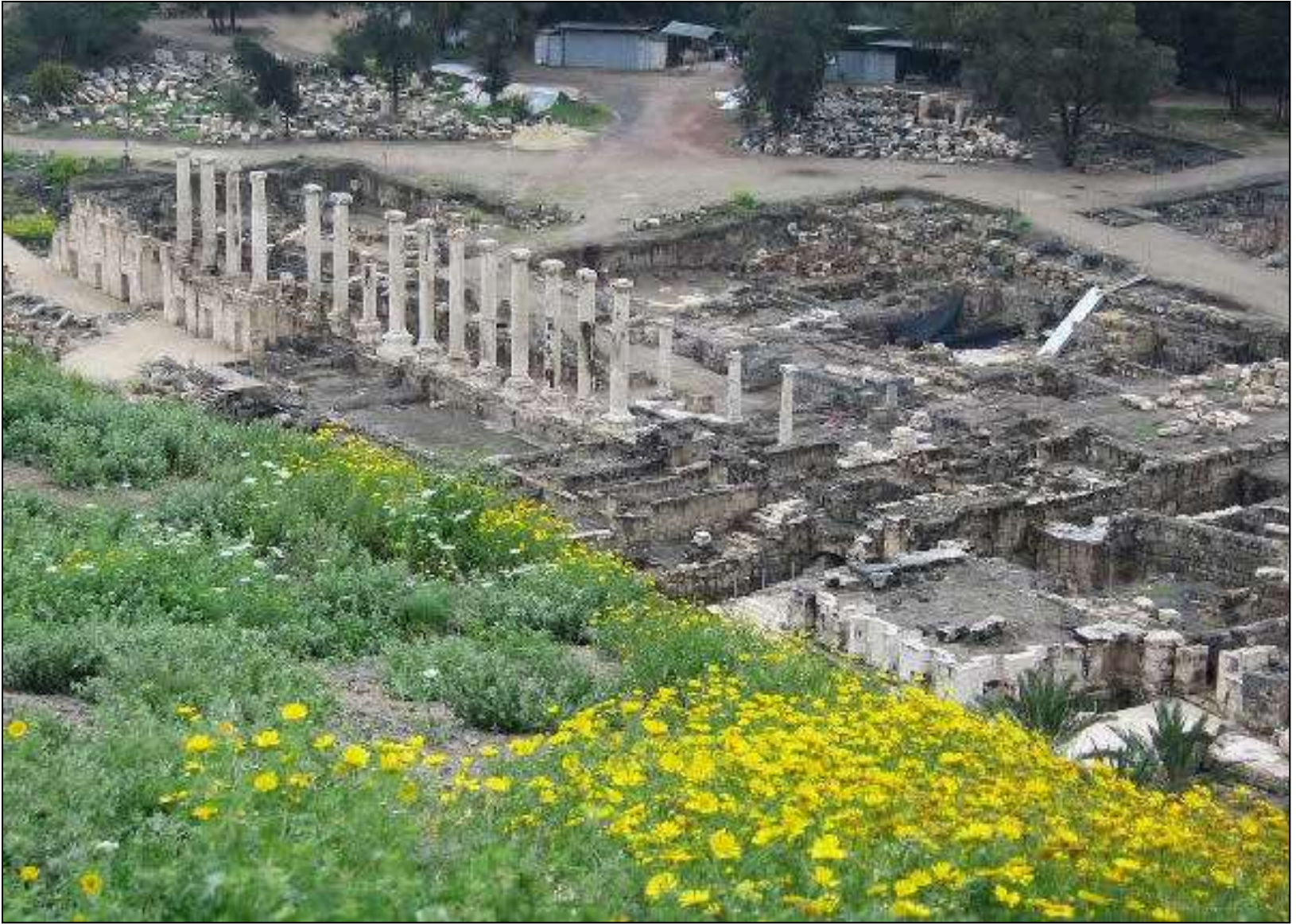
The ruins of Scythopolis, one of the towns of the Decapolis